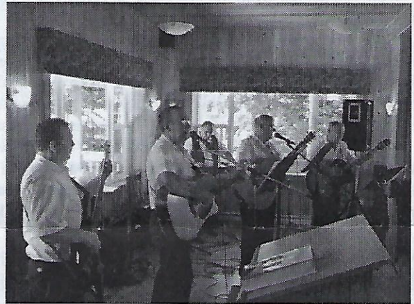
Music provided by NEW CREATION