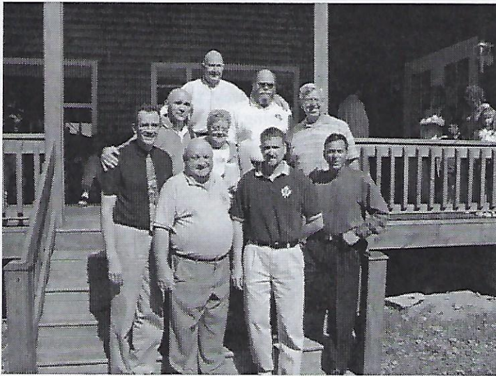
THE NEW NATIONAL BOARD OF DIRECTORS