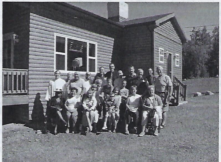
All smiles just before going home and back to work