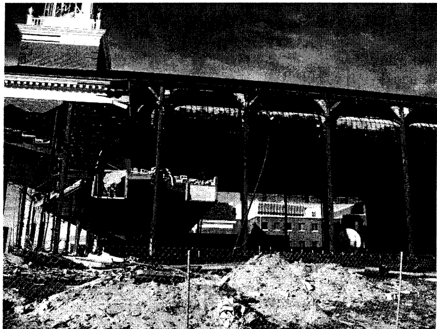
The destruction of wind and water in Hurricane Katrina. Buildings could not withstand the damaging power of such a force.