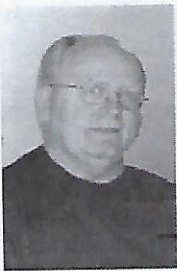
From the Editor's Desk

I don't know about you, but many times I am caused to wonder just how my heavenly Father sees me.