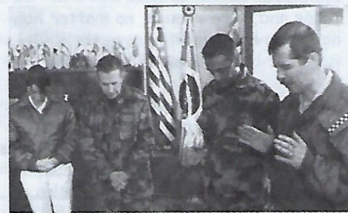
CBN News Story June 11, 2010

Television news scenes of police brutality in Sao Paulo, Brazil were not uncommon in 1997. The city, home to 22 million people, was plagued with problems like crime, corruption, pockets of extreme poverty, and an out-of-control police force.