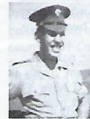
(The picture shows the author in Malta during the Suez Canal Crisis in 1957)

As a Christian you will find although your faith may be battered; it will also be strengthened. Trust me! And, if you are not a Christian, what do you have to lose?